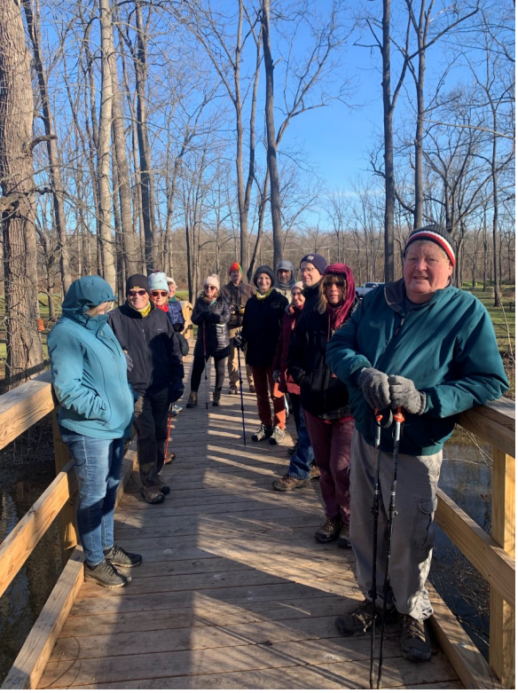
Some great folks out on some great Wednesday morning walks in Victor.